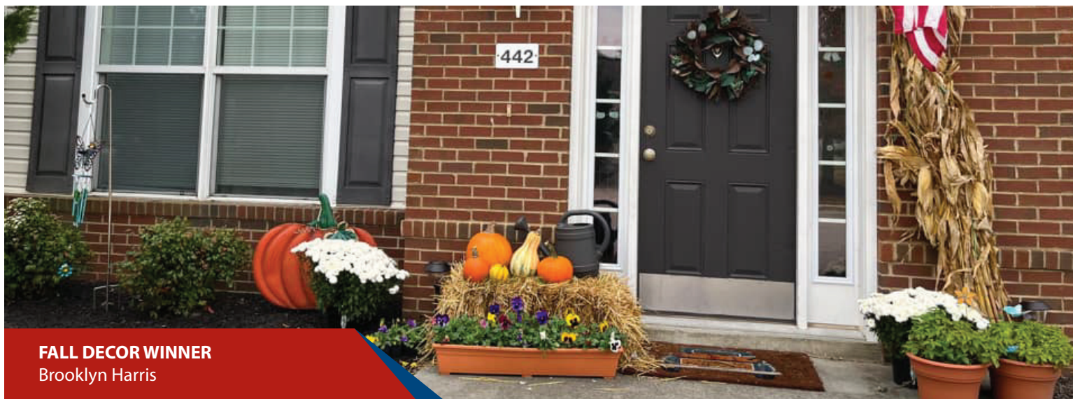
FALL DECOR WINNER Brooklyn Harris

Post a picture of you and/or your family in your favorite holiday sweater to FLFH's Facebook page. The photo with the most likes will win a $50.00 gift card. There will be TWO winners. The contest runs from December 19th – 27th.