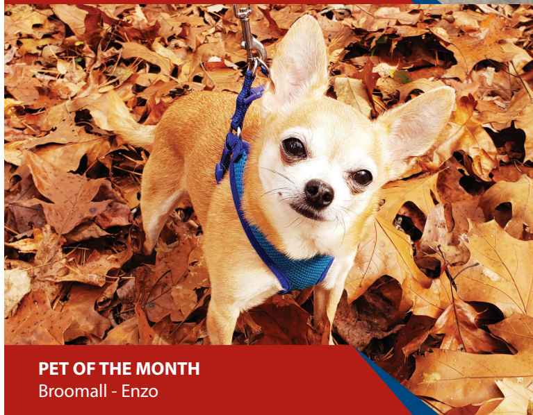
PET OF THE MONTH Broomall - Enzo